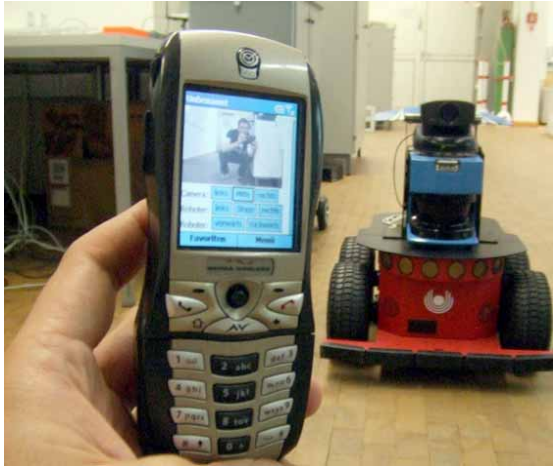
Figure 3: Pioneer 3AT mobile robot controlled by Windows Mobile 2003 smartphone

Some Windows CE NET 4.1 based devices, like the bSquare Maui are supporting a Java variant (Personaljava) 'out of the box' (included in ROM), but are not available on the market anymore. These devices are suitable to run an adapted PC control applet [3]. To overcome these restrictions a new approach based on asynchronous Javascript was realized. This asynchronous Javascript client sends user requests (button events) to the server without a reload of the web page. Each reload will stop the video stream initially and has to be avoided.