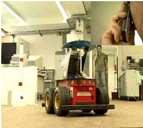
Figure 6: Pioneer 3AT mobile robot controlled by speech via cell phone

phone worldwide by a land line phone number (fig 6.). Such speech recognition interfaces to mobile robots will be very useful in robot human interaction in service robotics applications of the near future.