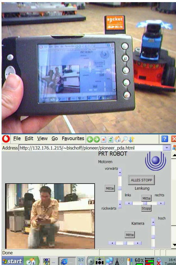
Figure 2: Web and Java AWT based GUI on a smartphone (640x480 pixel)

As an example of online mobile remote experimentation a robot remote control application which demonstrate the features of a PIONEER 3 -AT mobile robot was chosen.