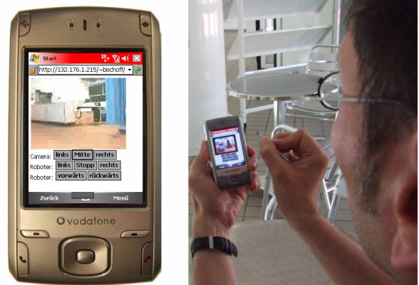
Figure 4: Pioneer 3AT mobile robot remotely controlled by Windows Mobile 2005 smartphone via GPRS

With asynchronous Javascript an application like behavior like a Java or a Flash can be established. In combination with the exchange of XML based messages between client and server these techniques is well known under the term 'AJAX' [5]. Windows Mobile does not support an AJAX