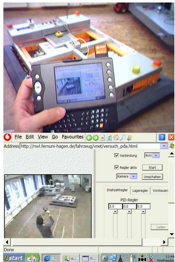
Figure 1: Omnidirectional mobile robot platform, GUI, experiment

New and since 2001 existing Web based remote laboratory environments [1] have been adapted to mobile